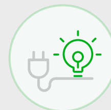
Plug-and-play Installation Saves Time