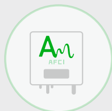
Optional Internal Integrated AFCI Module